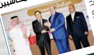
مندوبو جامعة العلوم التطبيقية يشاركون في الملتقى الخليجي الأول للمحاسبين في مدينة الرياض.

شاركت جامعة العلوم التطبيقية ممثلة بمندوبيها في الملتقى الخليجي الأول للمحاسبين الذي انعقد في مدينة الرياض بجمهورية السعودية العربية في الفترة من 14 إلى 16 من شهر أيار 2015م. وقد حضر الملتقى أكثر من 100 من المحاسبين من مختلف دول الخليج العربي. وتناول الملتقى في جلته الأولى موضوع «التحديات المهنية للمحاسبين في ظل التطور التكنولوجي» وفي جلته الثانية موضوع «التحديات المهنية للمحاسبين في ظل التطور التكنولوجي».