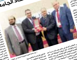
مندوبو جامعة العلوم التطبيقية يشاركون في مؤتمر اتحاد الجامعات العربية ببلنجان.

شاركت جامعة العلوم التطبيقية ممثلة بمندوبيها في مؤتمر اتحاد الجامعات العربية الذي انعقد في مدينة بلنجان بولاية الجزائر بالجزائر في الفترة من 14 إلى 16 من شهر أيار 2015م. وقد حضر المؤتمر أكثر من 1000 من رؤساء الجامعات العربية ووفودها من مختلف الدول العربية. وتناول المؤتمر في جلته الأولى موضوع «التعليم العالي والبحث العلمي في ظل التحديات العالمية» وفي جلته الثانية موضوع «التعليم العالي والبحث العلمي في ظل التحديات العالمية» وفي جلته الثالثة موضوع «التعليم العالي والبحث العلمي في ظل التحديات العالمية».