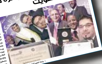
مندوبو جامعة العلوم التطبيقية يشاركون في مسابقة الابتكار الدولية.

حصدت جامعة العلوم التطبيقية جائزة دفع الحكومة الذكية لتطبيقات الهاتف بالكويت. وقد تم منح الجائزة لمندوبينا على مشروع «تطبيقية» الذي يهدف إلى تطوير خدمات الحكومة الإلكترونية. وقد أقيمت الفعاليات في قاعات الجامعة بحضور إدارتها وأعضاء هيئتها التدريسية.