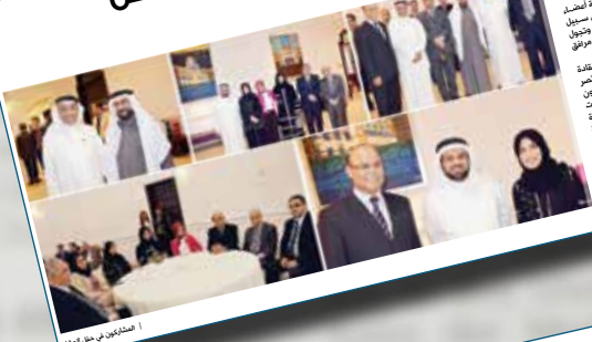
أعضاء المجالس في حفل العشاء.

تنظم جامعة العلوم التطبيقية حفل عشاء لاجتماعات المجالس الاستشارية بكليات الجامعة. وقد حضر الحفل أكثر من 100 من أعضاء المجالس الاستشارية وأعضاء هيئتها التدريسية. وتضمن الحفل تقديم عرض تقديمي عن سير العمل في الجامعة وأهدافها المستقبلية. وقد أقيمت الفعاليات في قاعات الجامعة بحضور إدارتها وأعضاء هيئتها التدريسية.