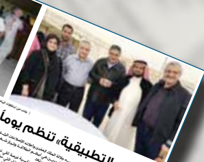
طلاب جامعة العلوم التطبيقية يشاركون في فعاليات يومها الترفيهي بمناسبة الذكرى السنوية للميثاق الوطني.

تنظم جامعة العلوم التطبيقية يوماً ترفيهياً بمناسبة الذكرى السنوية للميثاق الوطني للتعليم العالي والبحث العلمي. وقد حضر الفعاليات أكثر من 1000 من طلبة الجامعة وأعضاء هيئة التدريس. وتضمنت الفعاليات مسابقات رياضية وثقافية وفنية متنوعة. وقد أقيمت الفعاليات في قاعات الجامعة بحضور إدارتها وأعضاء هيئتها التدريسية.