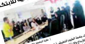
طلبة الجامعة خلال مشاركتهم في المسابقة.

تمثلت جامعة العلوم التطبيقية ممثلة بمندوبيها في مسابقة دولية للابتكار التي نظمتها الجامعة التونسية في الفترة من 14 إلى 16 من شهر أيار 2015م. وقد شارك في المسابقة أكثر من 100 من طلبة الجامعة وأعضاء هيئة التدريس. وتضمنت المسابقة تقديم مشاريع ابتكارية متنوعة. وقد أقيمت المسابقة في قاعات الجامعة بحضور إدارتها وأعضاء هيئتها التدريسية.